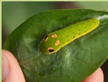
Spicebush Swallowtail Caterpillar

...some native tree species are the ONLY food for caterpillars and butterflies that we cherish.